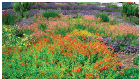
Figure 3: Denver City County Building Perennial Garden ( Zauschneria garrettii (bottom left).