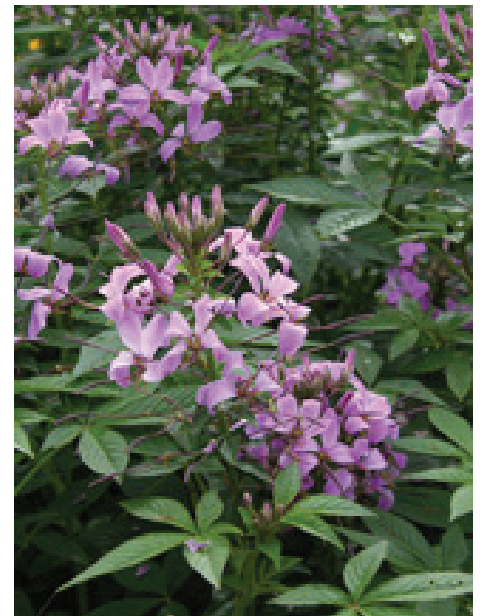
Figure 5: Annuals Cleome 'Senorita Rosalita'.