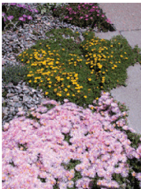
Figure 6: Perennials Delosperma Mesa Verde® (front) D. nubigenum (back).