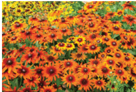
Figure 2: Annuals Rudbeckia 'Autumn Colors.'