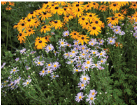
Figure 8: Perennials Rudbeckia fulgida (top) and Erigeron sp. (below)