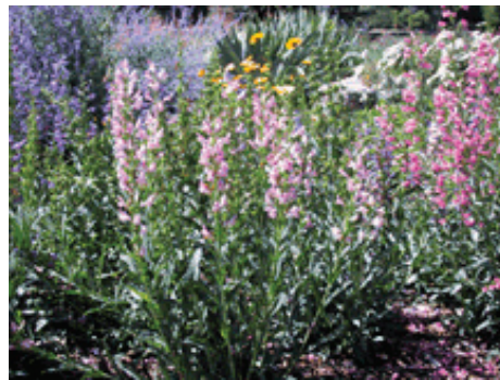
Figure 4: Perennials. Native blue Penstemon strictus (left) and P. grandiflorus Prairie Jewel® (center and right).