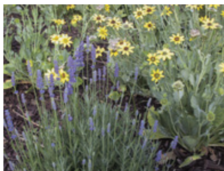
Figure 7: Perennials Berlandiera lyrata (top) and Lavandula angustifolia (below).